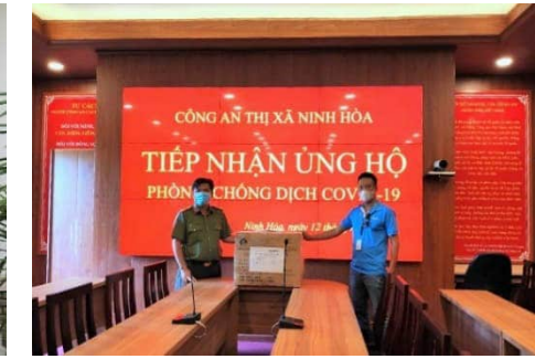
Leaders of Ninh Hoa town authority receive supporting package of medical supplies and equipment from VPCL